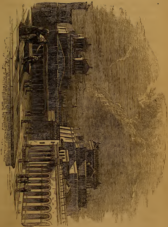
A ROMAN FORUM